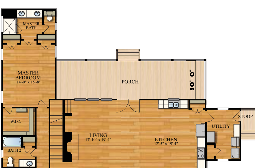
OPT. UTILITY ROOM & FULL W.I.C. AT MASTER BEDROOM 68'-4"

Plans, pricing, features and availability are subject to change without notice. Square footage is approximate and may vary per elevation. In an effort to constantly improve our plans, homes started in the future and some recently started homes under construction may have substantial differences from existing Trendmaker homes, including models, that may already be built. © 2011 Texas Casual Cottages By Trendmaker. All rights reserved.